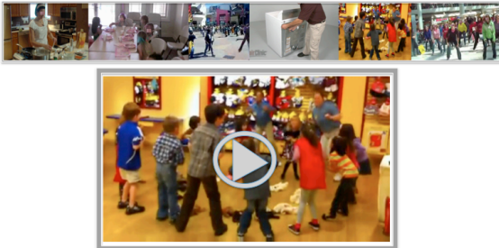
The video summarization system thinks this video is about Birthday Party because it found 3 Or More People Meeting in Indoor. From the video, the system heard the sound of music at first, then cheer, and then speech. The system observed food, people, room and indoor in the video.

We demonstrate the video summarization system in a dynamic web page. A screen shot of the demo page can be seen in Figure 2. The top gallery shows several videos for selection. The user can choose a video by clicking on it, and the selected video will play in the main area of the page. Once a video is selected and playing, a summary paragraph will be automatically generated and displayed underneath the video, presenting the video’s information in natural language.